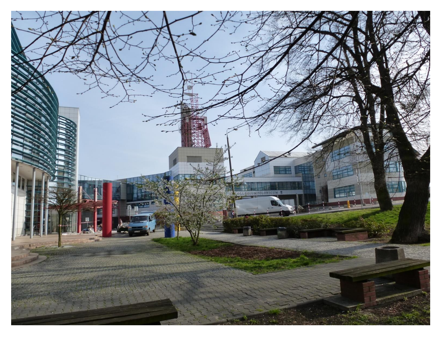
350 teachers from 25 European countries and Canada